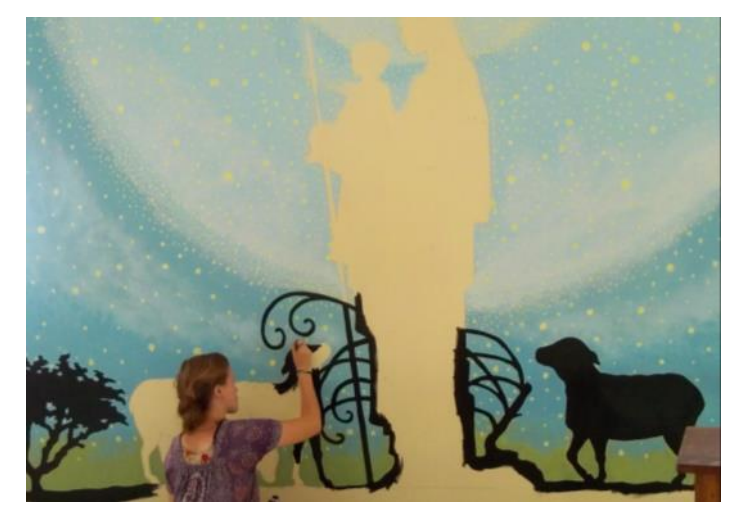
The artistic volunteer Bridget Elliott from Australia beautifying the study room of the girls.