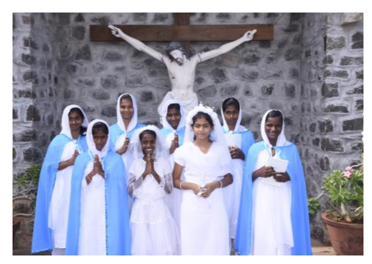
Six girls joined the Sodality of the Children of Mary on August 15th and two girls received first communion.