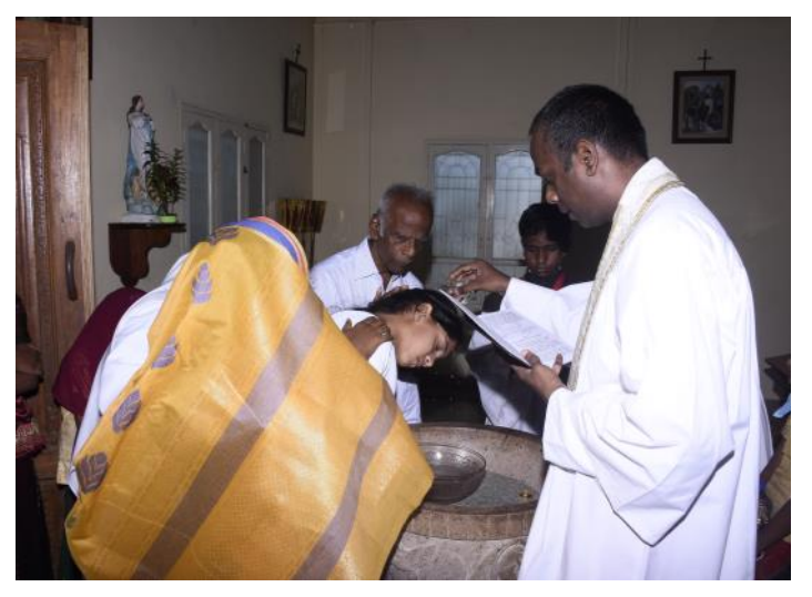
The life-saving waters flowing over Assunta Glory on the feast of the Assumption.