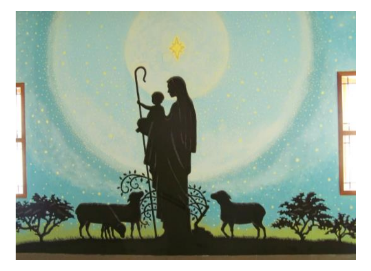
The final picture. It is like in Heaven!