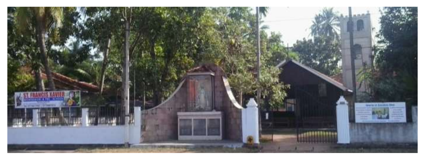
The Saint Francis Xavier's Messenger - #8 - September 2015 Newsletter of the Society of Saint Pius X in Sri Lanka