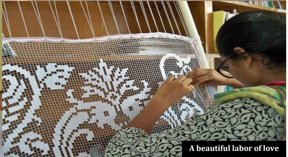
A beautiful labor of love