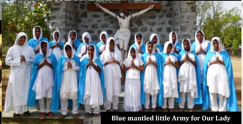
Blue mantled little Army for Our Lady