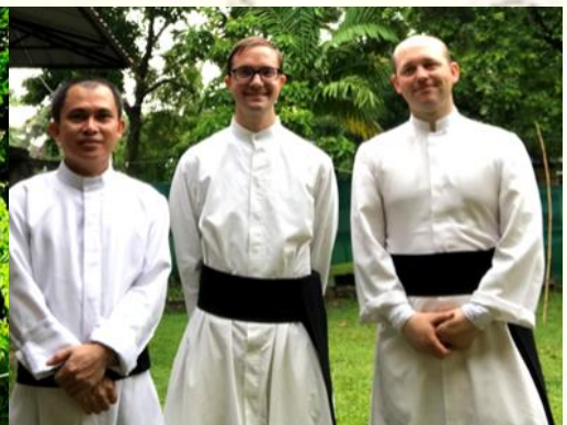
Sri Lanka Priory