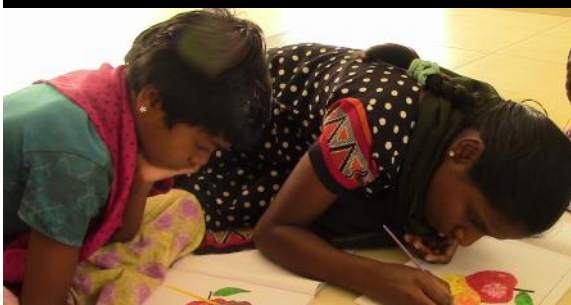
An apple a day keeps the doctor away!