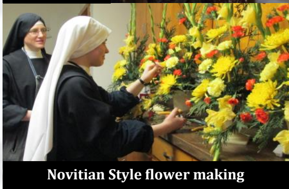
Novitian Style flower making