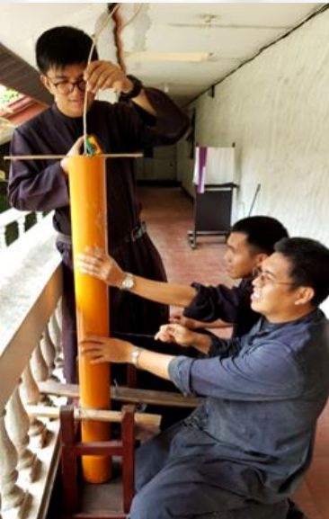
Brothers in arms for Paschal candle making

In the meantime, among many other things, we run the St. Ignatius exercises once a month, alternately for men and ladies. To do this in such a way that the religious life of the Brothers is not disturbed, we have built a