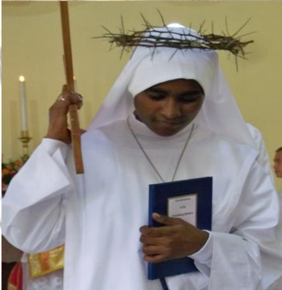
Another soul responded the call of God