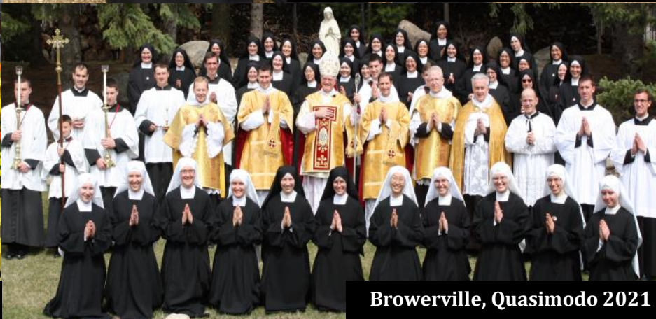
Browerville, Quasimodo 2021