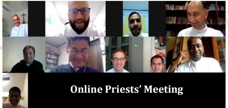
Online Priests' Meeting

the last time we would all meet together. After much delay, the new priory of Tokyo was opened (January 2021) and the Confreres have been able to propagate the faith in this mostly pagan country.