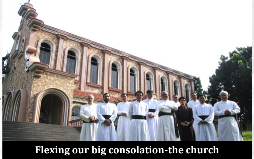
Flexing our big consolation-the church

“Sta. Familya Village”. Seven complete bamboo houses, clustered together, with all the comforts of life. This is at the far end of the property so that neither the retreatants nor the Brothers are disturbed. Yes, only seven retreatants at a time. St. Ignatius preached it to one at a time!