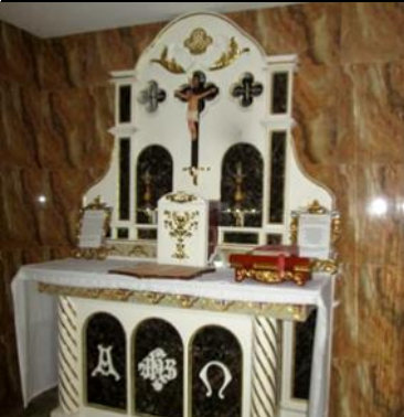
Crypt Chapel side altar