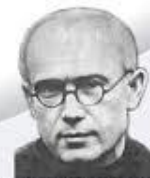
The Militia Immaculatae (MI) is the heritage of St. Maximilian Kolbe.

« The Immaculata is our ideal ! To belong to Her unreservedly, to shine forth into our surroundings, so that She might rule in all hearts, that is our precious ideal! »