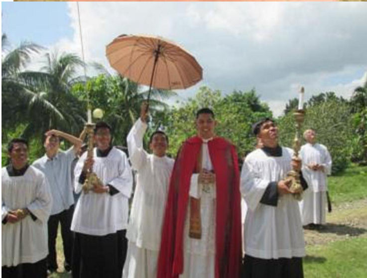
In ecstasy? Ehh no! Just looking on as the cross