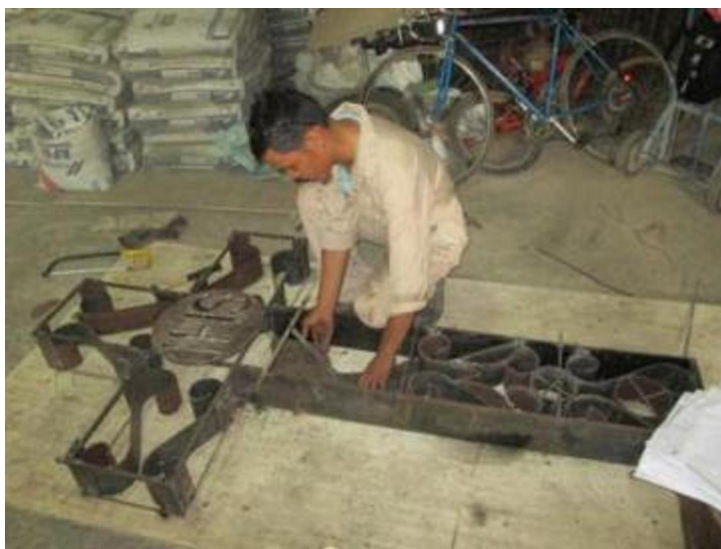
Bending the steel, rust-preventing and adding the appropriate colours ...