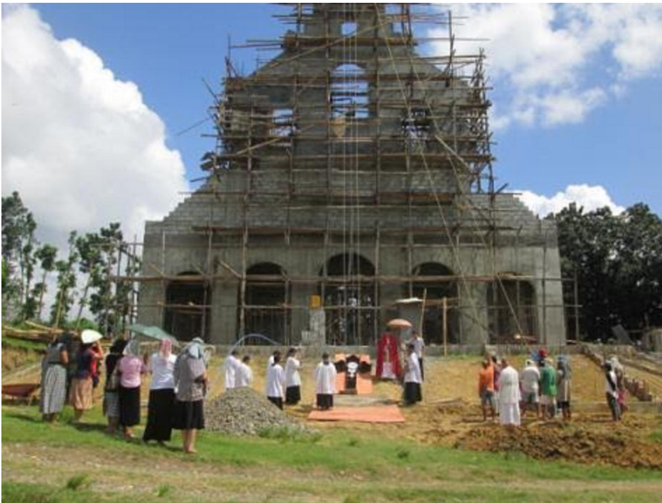
The solemn blessing, with holy water and incense ...